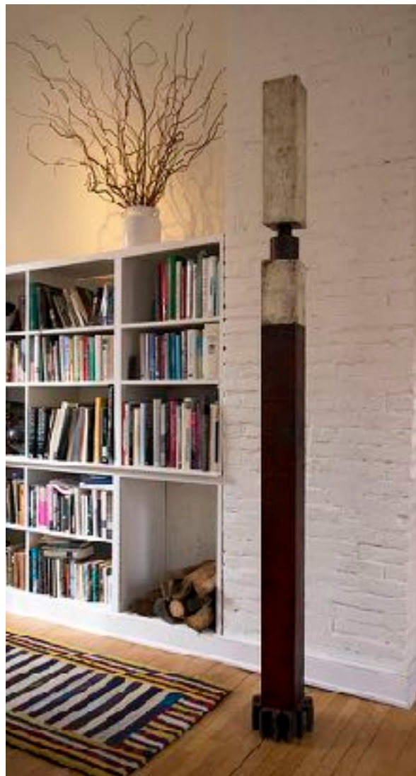
'Kili' Freestanding sculpture. Wood and found objects, encaustic 92" x 6" x 6"