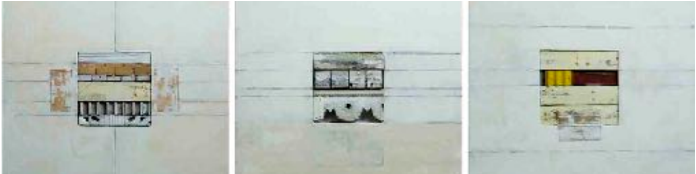
Sotto Voce Series, 20" x 20" each. Encaustic and found objects