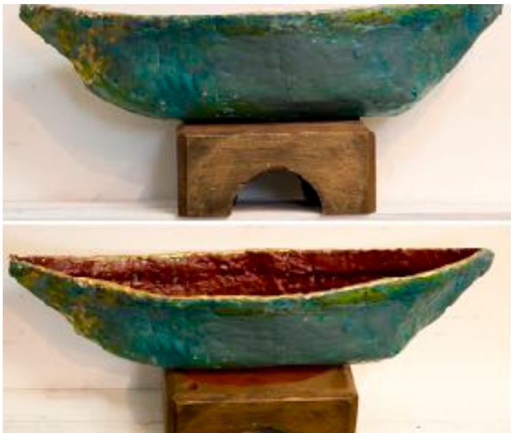
Boat on Pedestal, 2 views Wire, plaster and encaustic

We will continue building structures on Day 2