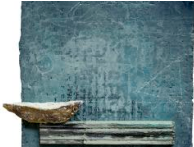
'Haiku Boat' Wire, plaster encaustic object on panel