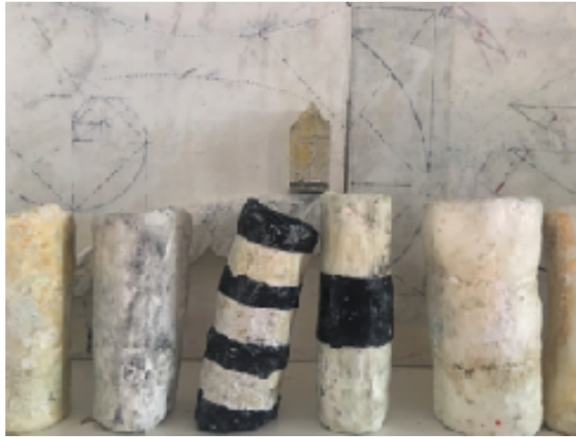
Cylinders made from wire and plaster, encaustic