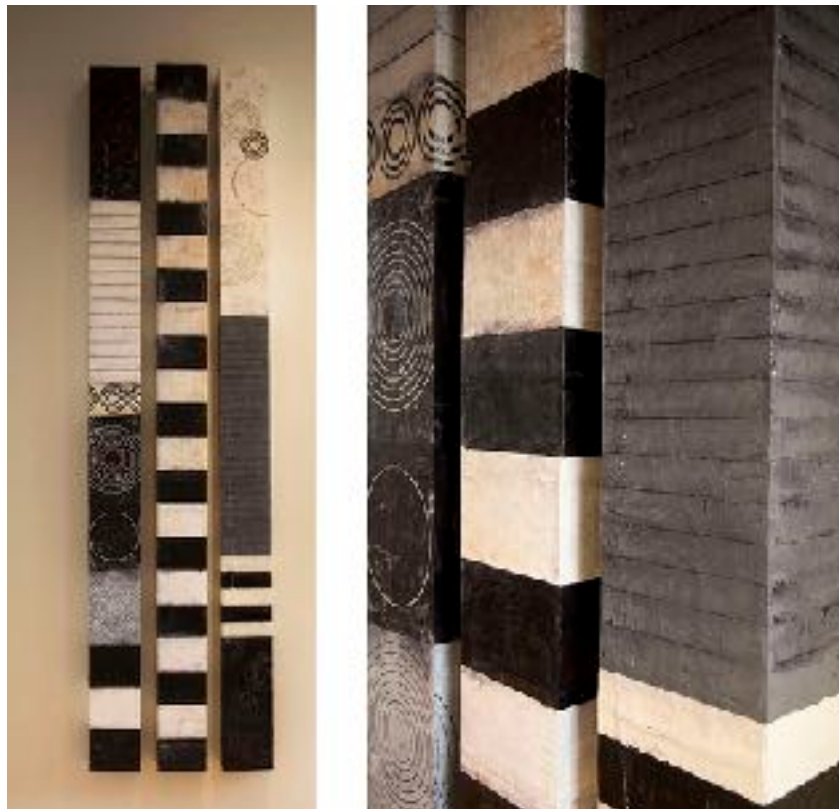
Wall Columns with Detail, Each are 84" x 6" x 4" Encaustic on plaster on wood