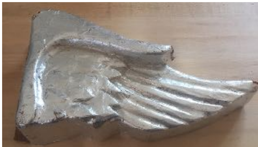
Wings created from carving foam, wax and leaf

We will begin to create the armatures for our pieces